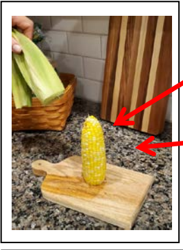
Ta da!! You can try cooking 2 or three ears at a time, adjusting the cook time. Have fun!

Now the fun part! Firmly hold the top (silk end) of the corn. Holding on to the husks and silks, gently shake. The corn will slide out the bottom end. If it won't come out, look at the cut end and make sure the cut is up into the corn portion. Also, a very under-cooked ear won't want to release.