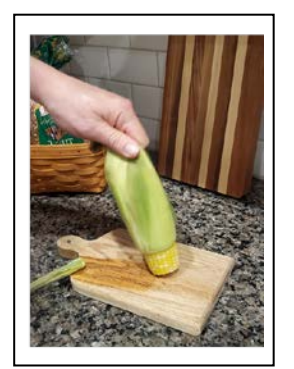
Now the fun part! Firmly hold the top (silk end) of the corn. Holding on to the husks and silks, gently shake. The corn will slide out the bottom end. If it won't come out, look at the cut end and make sure the cut is up into the corn portion. Also, a very under-cooked ear won't want to release.