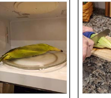
of time you choose.