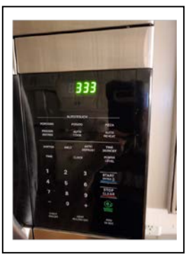
Place one ear in microwave. I cook on high for 3 and one half minutes. Experience with your microwave and size of the ear may alter the length