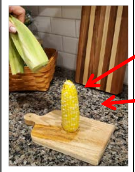
Ta da!! You can try cooking 2 or three ears at a time, adjusting the cook time. Have fun!