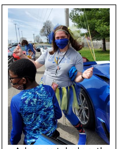
A dance party broke out!

Students and cars were paired up, and each child along with their teaching assistant climbed into the passenger seats, and the procession drove a parade lap around the school field. The entire route was lined with the entire student population,