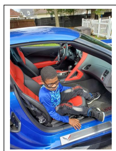
He chose the car that matched his shirt.

About 15 members and their cars showed up, first at El Mazatlan for lunch, then up the street to CTE. The school had us stage the cars in the drive, and as we got out of the cars, the children started making their way to the cars. One little guy immediately zeroed in on my car which is blue, his favorite color. Even his shirt was a perfect match to my car!